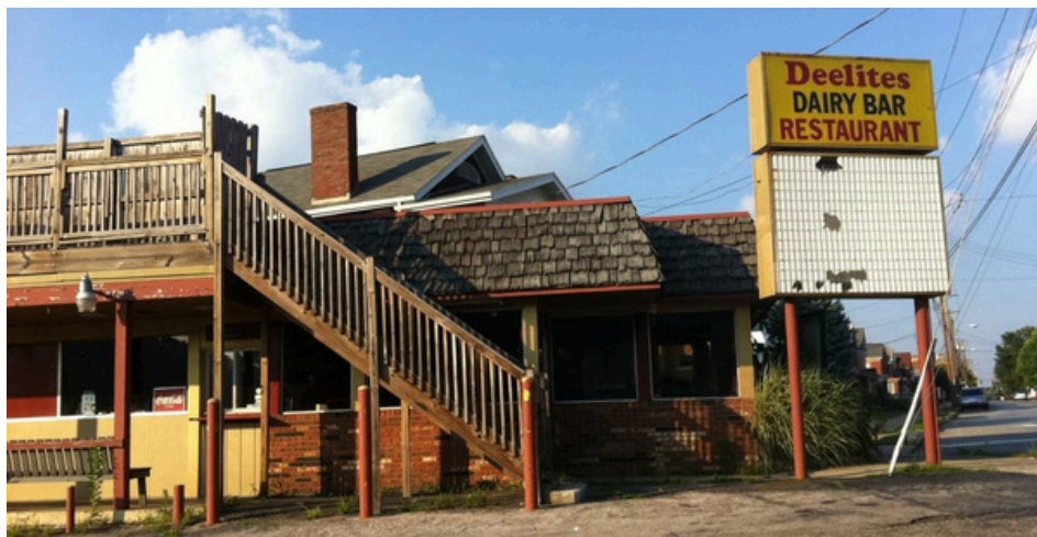
Pictured: 478 Elm Street in the late 2000s, operating as Deelites with their rooftop deck

Though perhaps not the most space with the opening of their historic building in Ludlow, the restaurant 1975, whose name pays homage to the LHS football state champs of the same year. 1975 will be open Monday – Friday for lunch and dinner, Saturday for Breakfast, Lunch, and Dinner, and Sunday for Breakfast and Lunch. Their menu will include burgers, chicken sandwiches, fries, soft serve ice cream and milkshakes, and will feature several items from the original Reeves Drive In menu – a double decker cheeseburger called the Big Burr and the Footlong Cheese Coney. Follow 1975 on Facebook for more information! commercial building sitting at the corner of Elm and Adela has seen its share of change. The structure was originally built by brothers Burr and Jim Reeves in 1958 to house their new business, Reeves Drive In (originally named Dairy Cheer but was renamed after learning of an existing business by the same name). Over the years this location has been home to a variety of eateries including Deelites Dairy Bar, Subway, and most recently, Bucks Barbecue. This year, Matt Brock and Austin Bauer are breathing new life into this